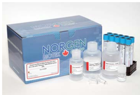
Tempus™ Blood RNA Tubes are not included with the kit

Purification is based on spin column chromatography using Norgen's proprietary resin as the separation matrix. The RNA is preferentially purified from other cellular components such as proteins. The purified RNA is of the highest integrity, and can be used in a number of downstream applications including real time PCR, reverse transcription PCR, Northern blotting, RNase protection and primer extension, and expression array assays.